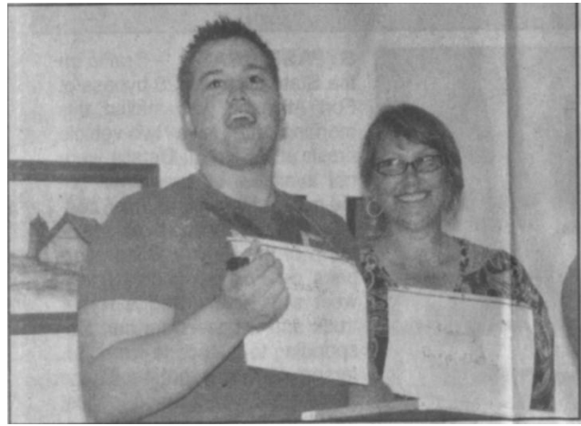
Two members of the "Drop Outs" team give their answer after consulting on a potential spelling.