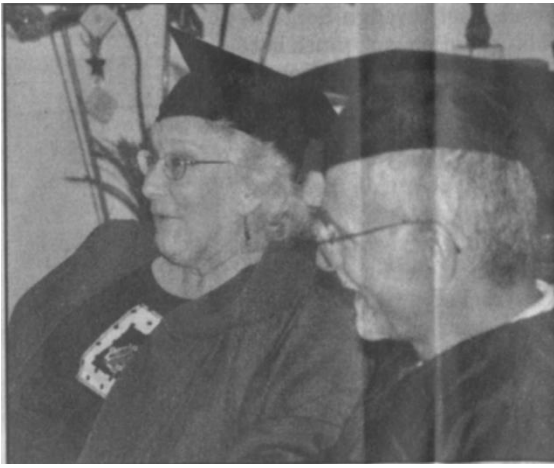
The two react to comments during the proceedings